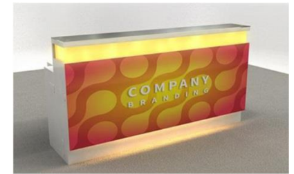
SmartCounter Overlay Graphic: 78.25" x 29"