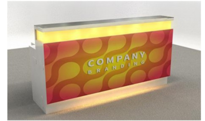
SmartCounter Overlay Graphic: 78.25" x 29"