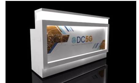
SmartCounter Overlay Graphic: 78.25"